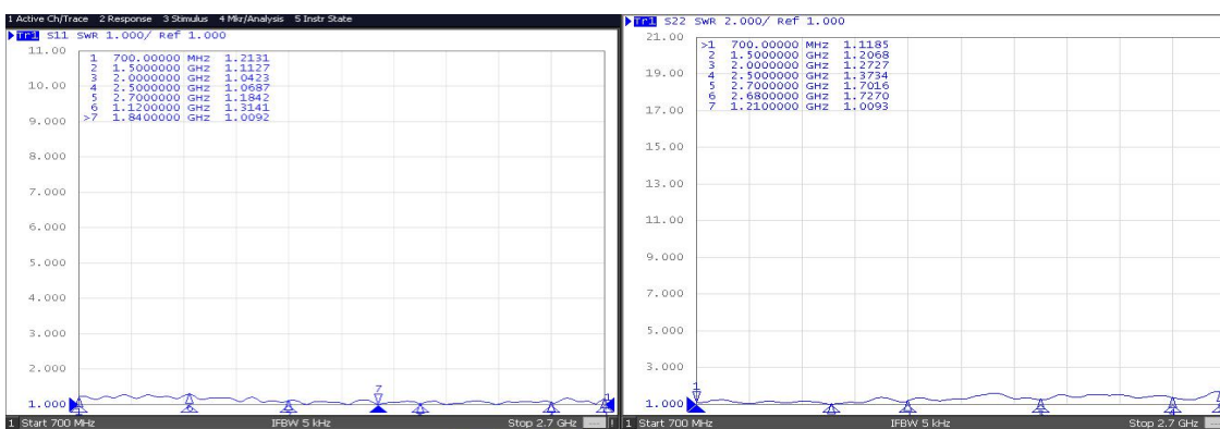
Figure left: Input Return Loss S11 ([Pin=-30dBm, CW, Load VSWR≤1.2, 25°C]