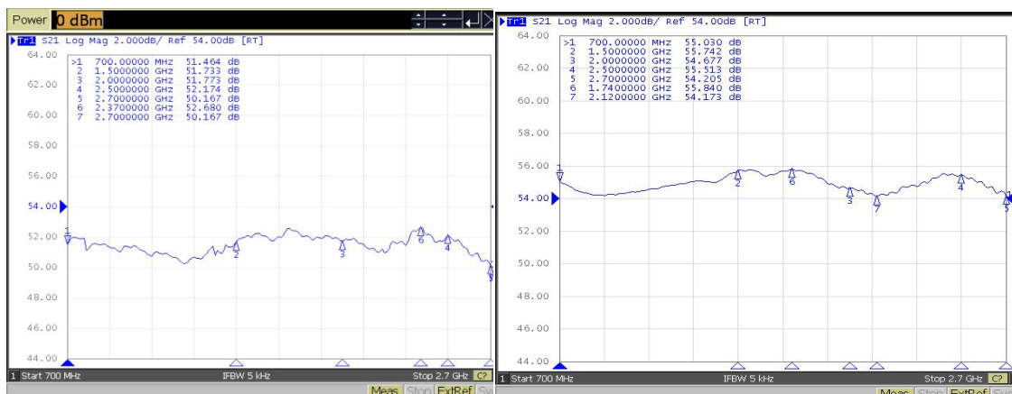
Figure left: Power Gain S21 (Pin=0dBm, Load VSWR≤1.2, 25°C),For reference only.