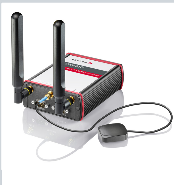
VN4610 Network Interface with GNSS receiver